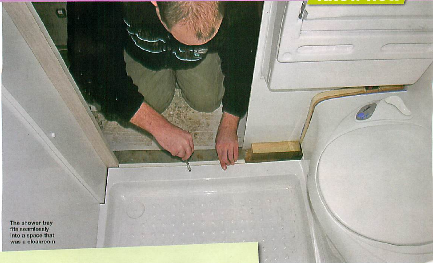
The shower tray fits seamlessly into a space that was a cloakroom