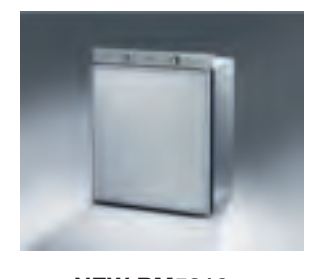
NEW RM5310 Replaces RM4210 + RM4211LM + RM4213