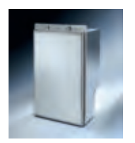
NEW RM5330 STEP FRIDGE Replaces RM4230L + RM4233*