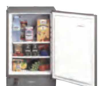
RM122- 2way Piezo RM123- 3way Electronic

From brands such as Cramer, SMEV, Seitz, Waeco etc.